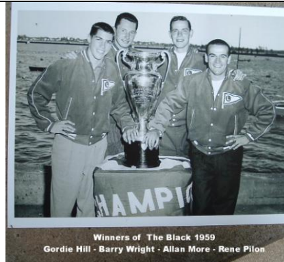
The 1959 Black Trophy Winners